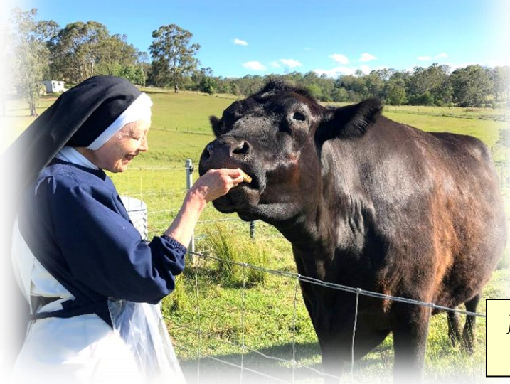
John, our eldest steer, likes bread – you might call this a beef sandwich!