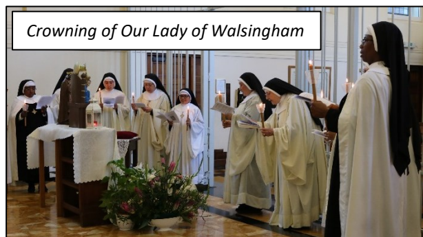
Crowning of Our Lady of Walsingham

We purchased a statue of Our Lady of Walsingham, which was later paid off by some of our kind friends and benefactors, and which arrived from Walsingham just in time for the rededication of England to Our Lady. We had a special all-night vigil for the conversion of England during which the Chapel main doors were left open all night so that anyone could join us if they so wished. We later had a special crowning ceremony for her