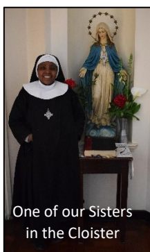
One of our Sisters in the Cloister

Candidates are put on probation for one year to study the spirit of the Association. After this year, the candidate makes the Act of Consecration and is admitted to full membership and will then be inscribed in the Book of the Association of Tyburn Convent. The members of the Association will be included in the daily Prayers of Intercession at Vespers at Tyburn. On the Saturday after the Solemnity of the Sacred Heart, Holy Mass will be offered for all members. In November, Holy Mass will be offered for the repose of the souls of all deceased members. On the death of a member, Holy Mass will be offered at Tyburn, and the name will be entered in the community Necrology. If you are interested, please get in touch with the Vigilant Mistress.