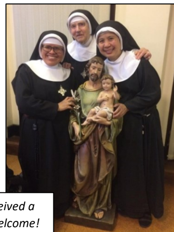
St Joseph received a very warm welcome!