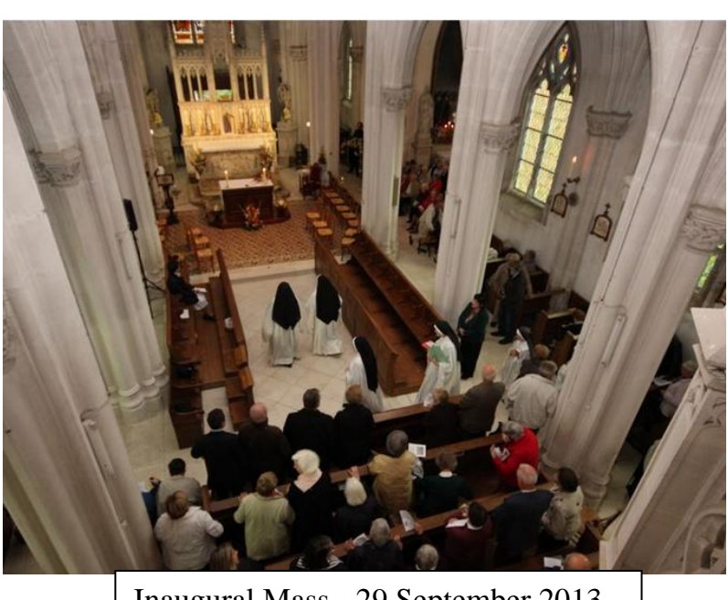
Inaugural Mass - 29 September 2013

3 rue du Couvent, 52210, Saint Loup sur Aujon, France.