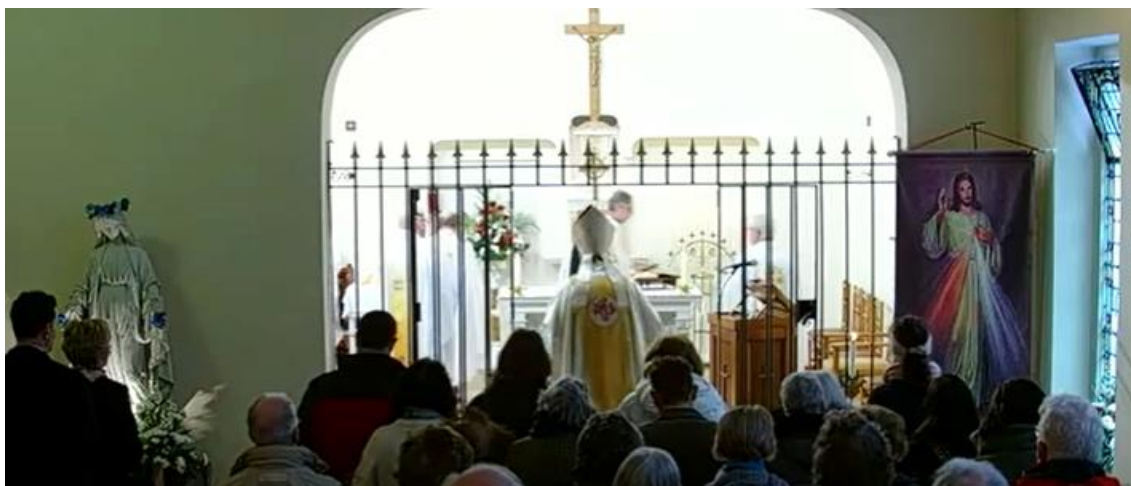
Votive Mass of the Sacred Heart