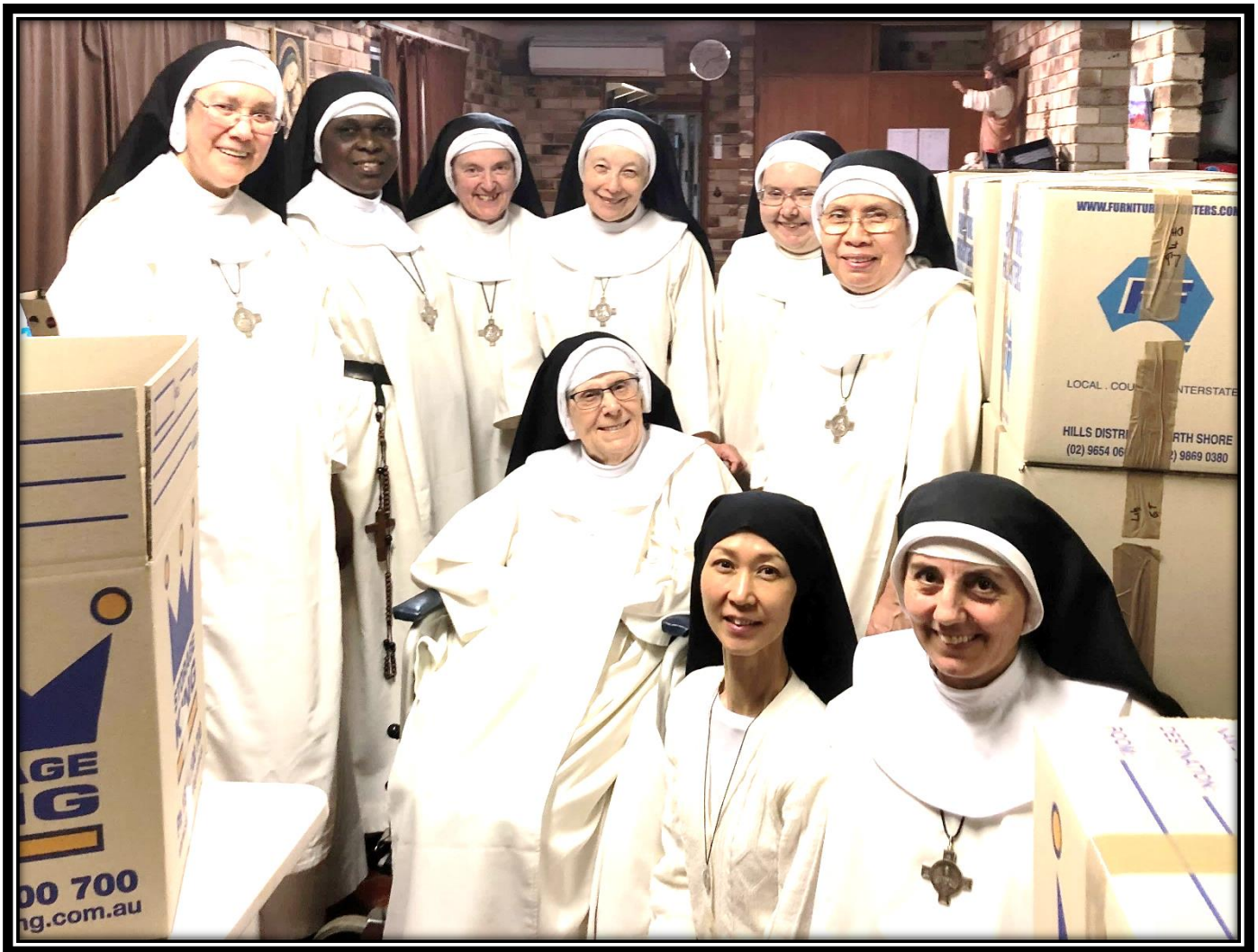
Here we are amidst all our boxes of library books just packed!

It remains for us to wish you a blessed and happy Christmas. Our Christmas Midnight Mass will be offered for the intentions of all our friends and supporters.