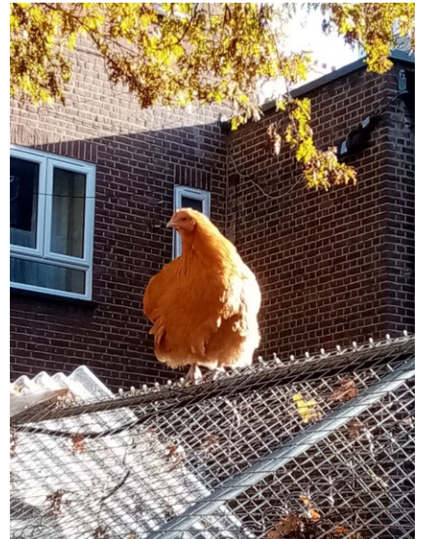
One hen caught flying to the roof top to try and grab a bit of winter sunshine before it disappears!