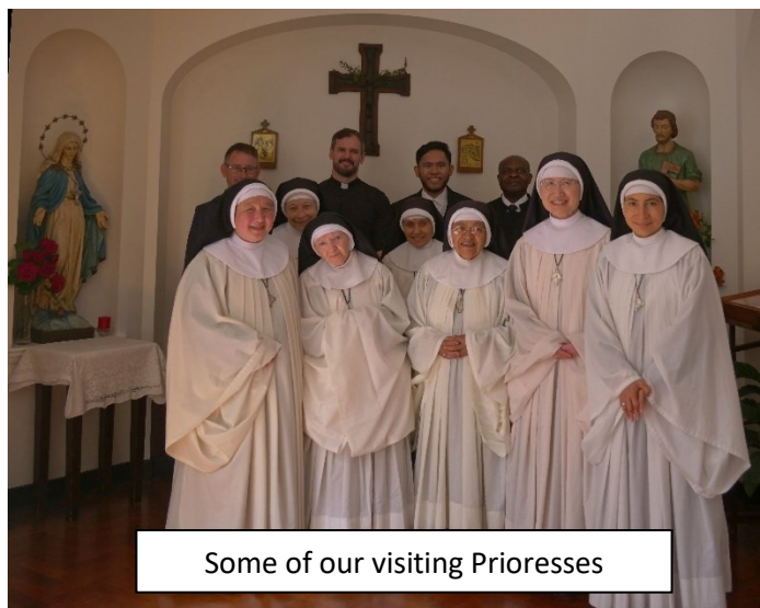
Some of our visiting Prioresses