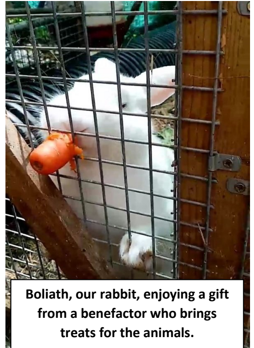
Boliath, our rabbit, enjoying a gift from a benefactor who brings treats for the animals.

We wish you all a Happy and Blessed Christmas and New Year. The Holy Sacrifice of the Mass will be offered as usual on Christmas Day for all our friends and benefactors living and deceased. May the peace of the Christ Child enter your hearts and your homes and remain with you throughout 2024!