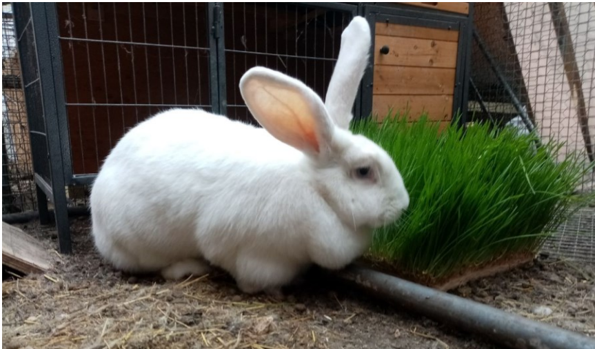
Beautiful Lizzie with her fodder

Fodder is also good for the rabbits and the quails and they really love it. Over summer, vegetables were growing in our little garden in every available space and pot. The cucumbers, climbing beans and cherry tomatoes did especially well. Our two grape vines also produced abundantly. Now the chickens have been let loose to happily finish up any remaining green while scratching and turning over the soil for next year's crop!