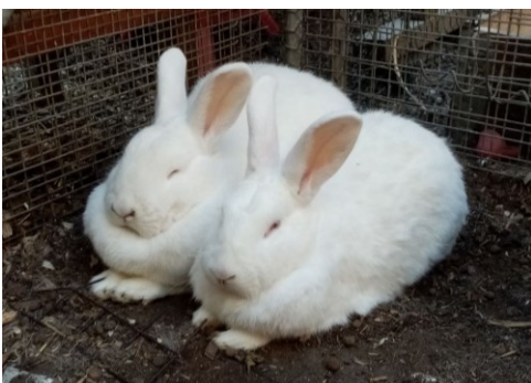
Bartie and Gartie (Mother and daughter) get along well together!