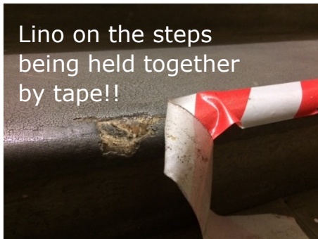
Lino on the steps being held together by tape!!

One of our benefactors kindly asked what our next fundraising project will be. Well, as you might be able to imagine, the maintenance and running costs of such a large building never ends!