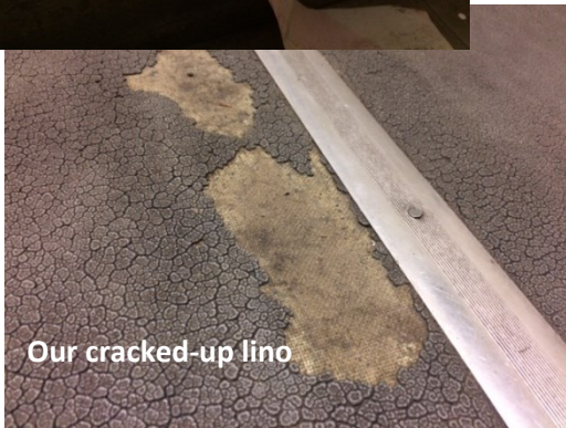
Our cracked-up lino

We have had to put off for a very long time, for one reason or another, the renovation and refurbishment of our Retreat House. But now it has come to a stage where we can no longer delay.