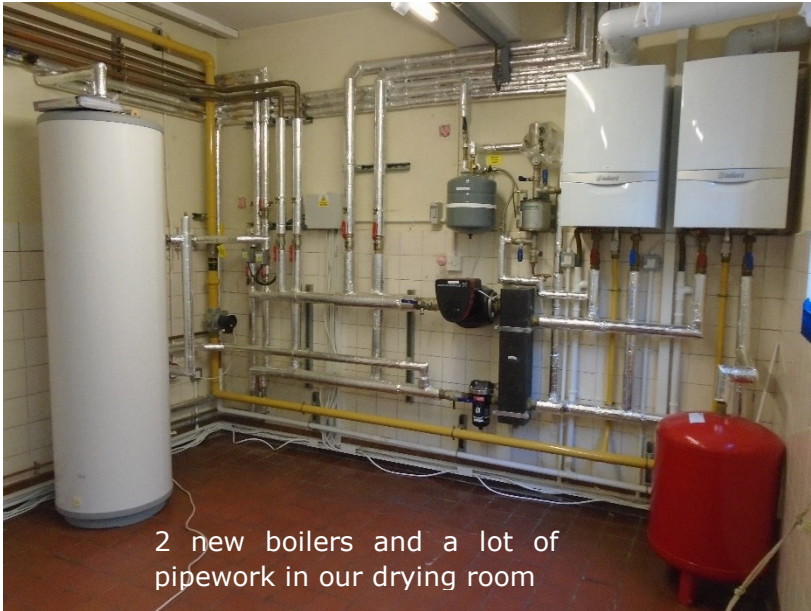
2 new boilers and a lot of pipework in our drying room

Previously, we had a number of very old water tanks dating from the 1950s and 1960s. There were about two to four of these on each floor and they used up an enormous amount of energy. Some water tanks were used only to heat 1 to 3 sinks. All of these were replaced with just one large water tank. In addition, we installed one of the newest technologies currently available for heating water – thermodynamic panels.