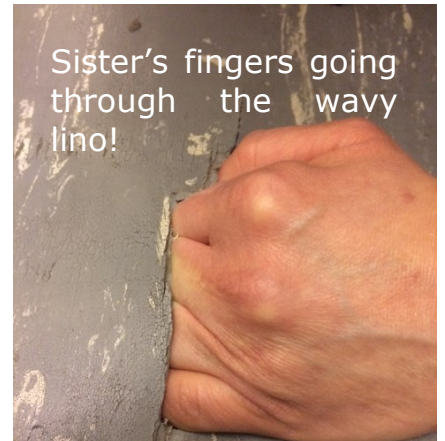
Sister's fingers going through the wavy lino!

Many of you would be familiar with our old and faithful grey linoleum which has donned our floor for the last fifty years. It has served us faithfully, it has run the good race but now we must lay it to rest. For some unknown reason, in the middle of the guest kitchen, the lino has become like an ocean wave, has risen off the floor and has parted and rent. It