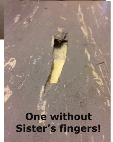
One without Sister's fingers!

reminds some of us of the first line of one of our hymns in our Tyburn hymnal: "The waves of the Red Sea were parted, rent". The photos show examples of the pressing need.