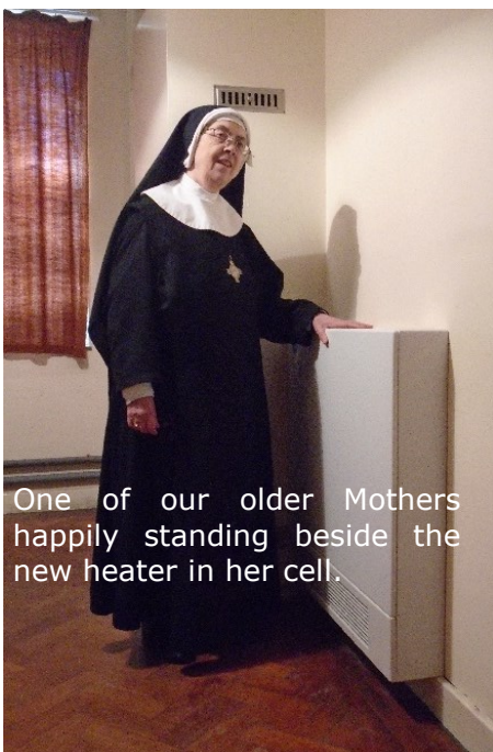
One of our older Mothers happily standing beside the new heater in her cell.

We have, thanks to your overwhelming generosity and support, finished fundraising for the heating and hot water renewal!! We wish to THANK YOU so much for your kindness and generosity towards us. On the 4 th of April, we completed the fundraising for our heating and hot water systems with a final donation. It has been very moving and overwhelming to see such love and generosity from so many people and it has taken only one and a half years from start to finish of the fundraising. Our trusty heating workmen have only one week left to finish off their work and the decorators are due to come after that to patch things up where needed. We all wish to thank you by continuing to pray for you, your families and your intentions which you have confided to us, and for ALL your intentions which are known to God.