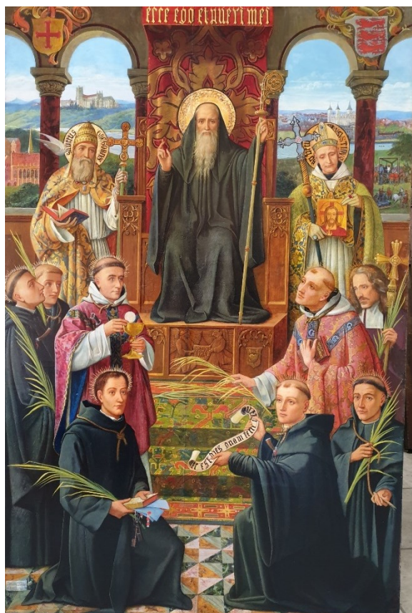
The restored paintings.