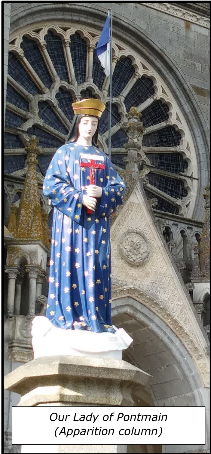
Our Lady of Pontmain (Apparition column)