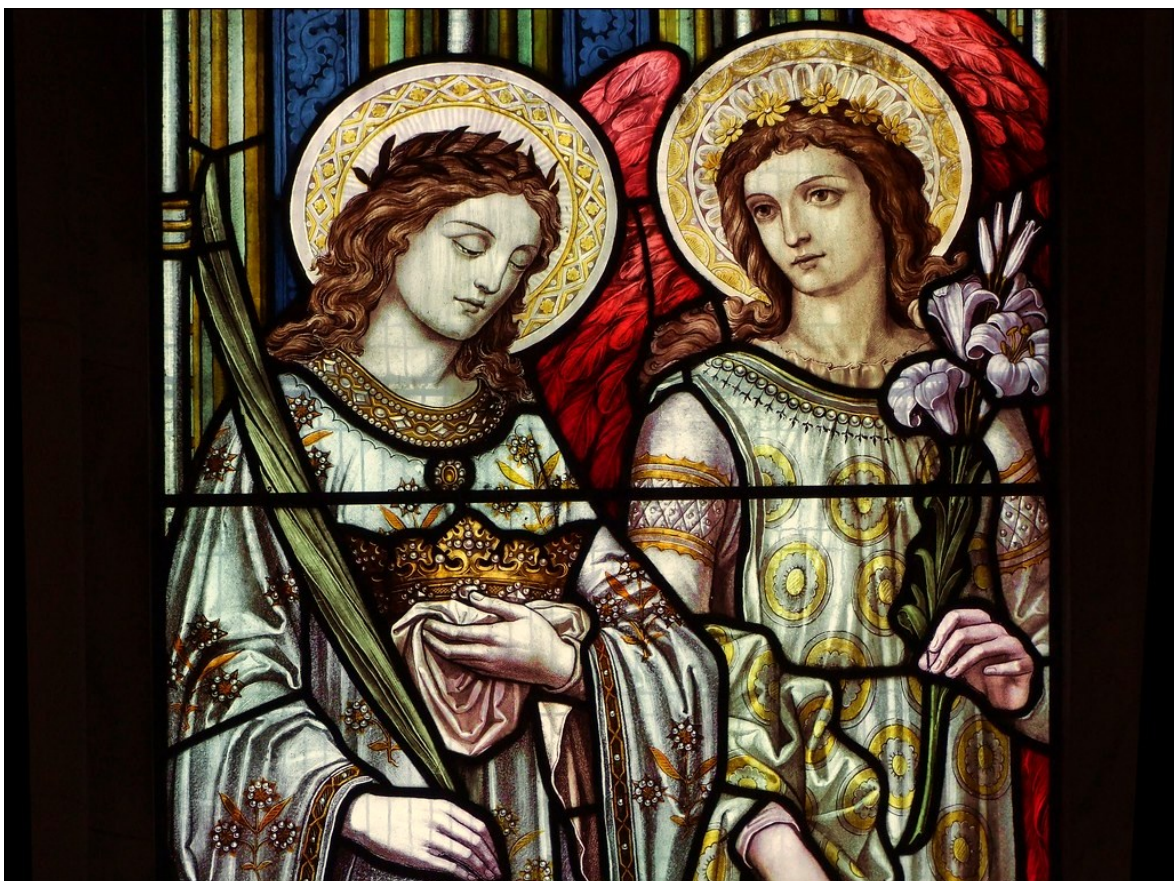
A Martyr and an Angel