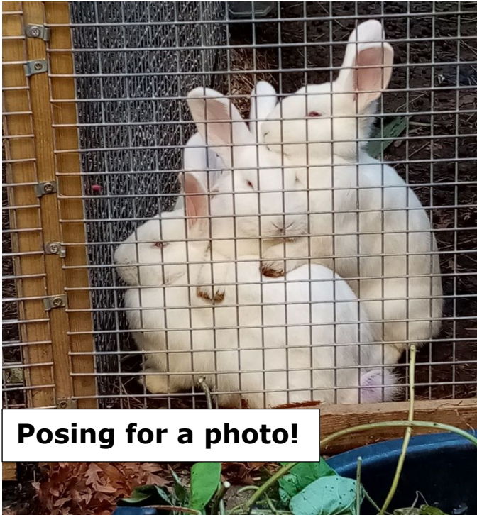
Posing for a photo!

The raising of chickens and quails and the breeding of rabbits successfully continues. What rabbits are to breeding, quails are to egg laying. One of the setbacks about living in central London is that space is at a premium. Perversely, the more successful we are the less space we have! Sadly our rabbit family suffered some losses. The founding father, Abraham suddenly died and his successor, Goliath, (and he was a big boy!!) also suddenly passed away. Goliath was pictured in our Sacred Heart newsletter near