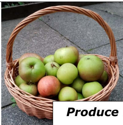
Produce from our garden!