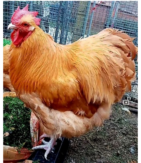
Our beautiful cockerel - Br Tweedle Dee.

the statue of Our Lady. Both these rabbits were very young. So we decided to call their successor, Methusalah, after the longest living man in the bible, in the hope that such a name would encourage longevity! One of our rabbits, Keturah has just given birth to 7 little bunnies . . . 3 of whom are already wanted as pets. As soon as they are 8 weeks old they can go to their new homes.