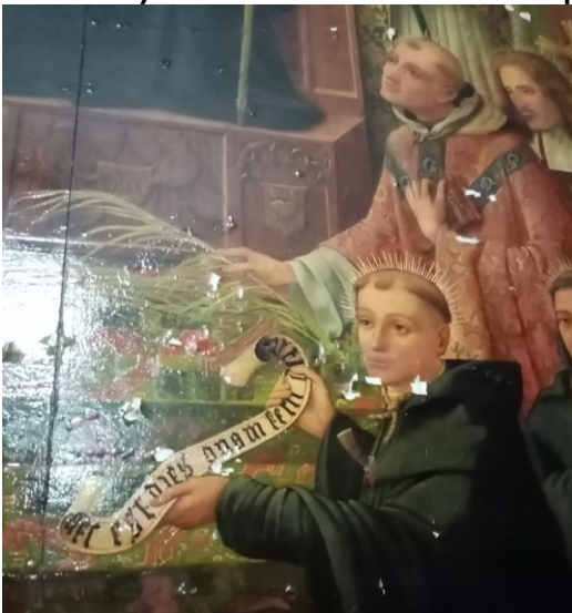
Some of the damage can be seen in the detail of this photo.

strongly to the inward ears. The celebrant, our Prior, steeped in the abundance of this divine sweetness, was so deeply affected that he had for some time to suspend the solemn Mass already begun. This grace of spiritual unction granted by God's mercy was not received by the monks only nor confined within the limits of the choir, but the sound went forth to the whole building. Passing from end to end of the church it reached the converse brothers, softly charming hearts and ears. All whom that sound reached gladdened.