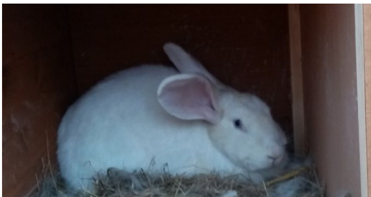
Lizzie made a nest and used it for a bed instead!