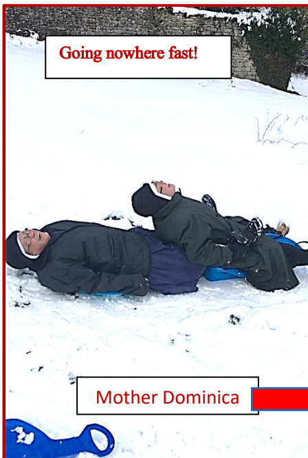
Going nowhere fast!