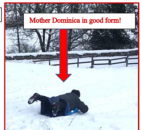
Mother Dominica in good form!