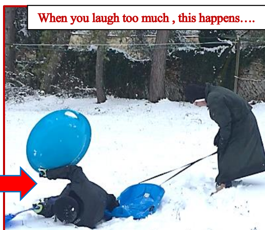
When you laugh too much , this happens....