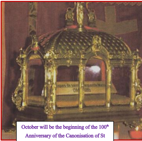
October will be the beginning of the 100 th Anniversary of the Canonisation of St Margaret Mary!

And now for some exciting news! We are pleased to announce that: