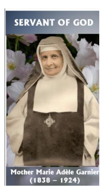
"We know that God does everything for the good of souls, and He can draw this good from the greatest of evils."