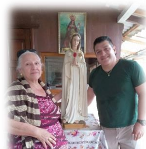
Donors of Statue of our Lady

A joy for this community was the donation of a statue of our Lady Rosa Mystica as well as two stone angels. They were also able