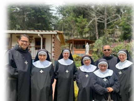
The Tyburn Monks with community

interest. However, our printer has now reached the end of its printing capacity and is not functioning properly, so we need to purchase a new one. We have also collaborated with Radio Maria, taking part in a series of short videos entitled "the Virtues of Mary" which will go live shortly. Our video was entitled "the virtue of prayer" and showed footage of our community at prayer, and Sisters prayerfully carrying out their various activities.