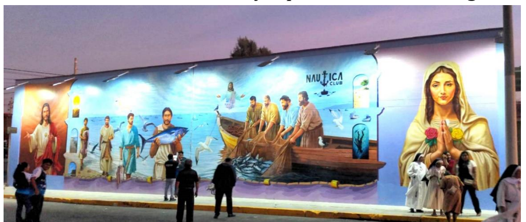
New monastery wall

The front wall of the monastery which had been crumbling to pieces has been repaired. But more than that, it has been decorated! As it is along a street, it has been beautifully painted with large