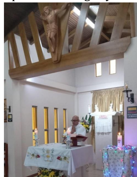
New crucifix above altar

of their small chapel. Due to the faith of the people, godparents are named for the statue! A sister writes "December the 13 th arrived and