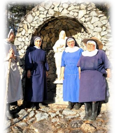
Grotto of St Joseph

tradesmen and chaplains were all very cooperative about abandoning their vehicles and