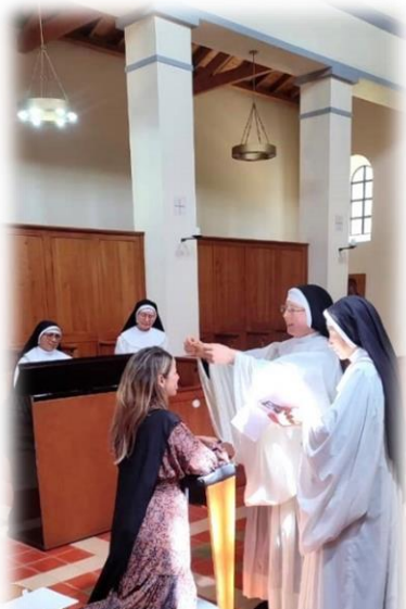
Reception of an oblate

This year our big focus has been on publicity, to make our vocation better known. We designed a flyer and a 16-page information booklet. This has already borne fruit, and two young women are currently experiencing our life, with 8 others expressing an