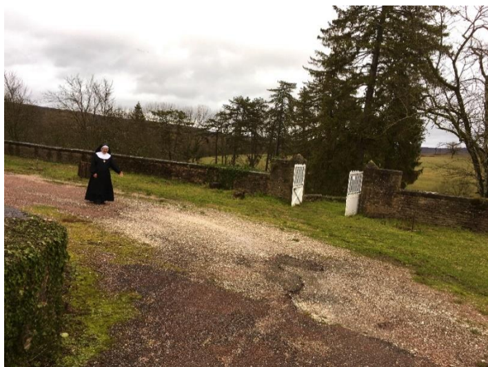
Deteriorating driveway, France