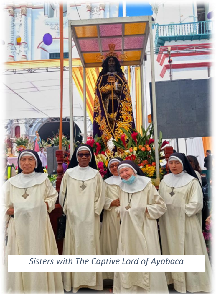
Sisters with The Captive Lord of Ayabaca

Our monasteries in Latin America have many feasts special to the region. One of these in Peru is the Captive Lord of Ayabaca and during October it is common to see pilgrims in purple garments making the journey on foot to Ayabaca. Many pilgrims travel days or months just to be able to look at and pray to the Captive. This year the miraculous image was taken to various parishes, and our Sisters in Sechura were among those privileged ones.