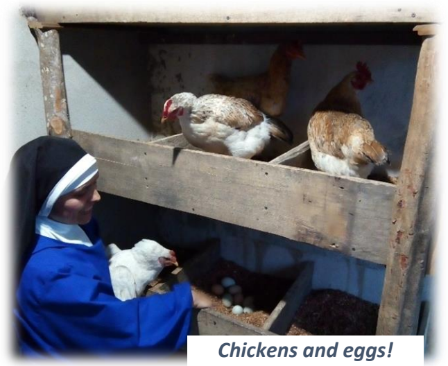
Chickens and eggs!

At the monastery, the Sisters continue to welcome many guests as well as host the baptisms of children and the occasional wedding in their small chapel. With the generous donations received, they have been able to build new bathrooms in the guesthouse and