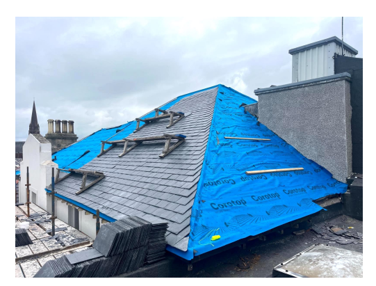
Work in Progress: Main South Roof