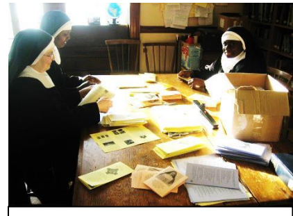
Preparing literature for the Divine Mercy Conference!

For the first time, in May, we hosted a large Parish group from Lough Parish in Cork. They arrived together at around 10.00am and began their day by saying the Act of Consecration to the Holy Trinity recited daily by our Sisters. They then came downstairs to our Oliver Plunkett Centre for tea and biscuits, and were given a presentation by our Sisters