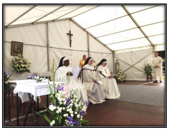
Monastíc Professíon 18<sup>th</sup> September 2021